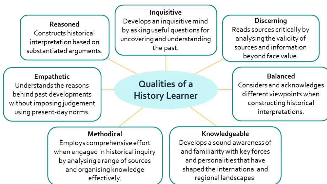
Figure 1. Qualities of a History learner

History prepares students to thrive as citizens in a complex and fast-changing world by equipping them with the knowledge and skills to understand how forces, events and developments of the past shaped today's world. It also develops in students a disciplined and critical mind to discern and make informed judgements based on consideration of multiple perspectives, reasoned and well-substantiated conclusions. History also helps students to participate actively in a globalised world, as they learn to make sense of ambiguous and complex global developments, appreciate local contexts and engage with different cultures and societies sensitively. These are encapsulated in the seven qualities of a history learner which the History curriculum aims to develop: